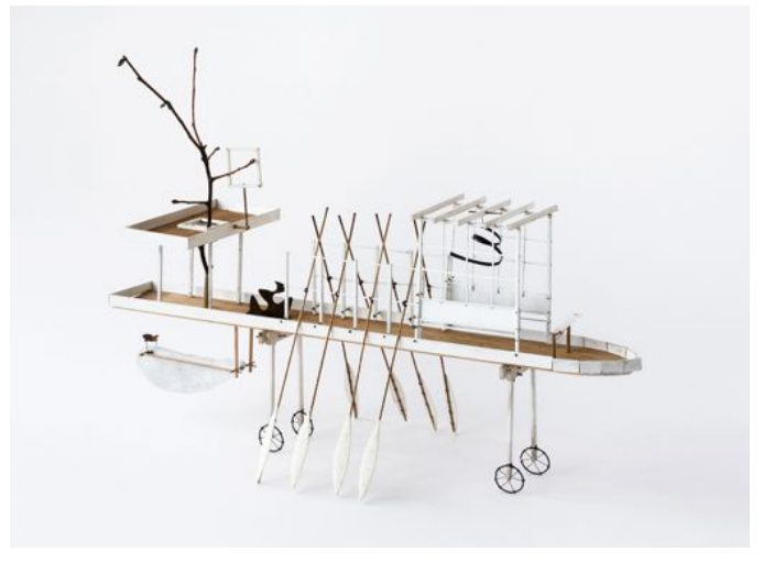
Homage to Octave Chanute (1832 – 1910), 2014, wood, tin, aluminum, steel, brass and copper 17 \frac{1}{2} x 24 x 10 in

The Drawing Room is pleased to present ADRIAN NIVOLA sculpture , an exhibition inspired by the passion, ingenuity and daring of some the world's earliest and most adventurous aviators. Nivola's marvelous wire constructions depict fictional, fantastical flying machines of the type that fueled the dream of flight throughout the 19<sup>th</sup> century. Also on view through August 31st, SUE HEATLEY new works on paper , an exhibition of 12 unique, mixed media compositions that combine printmaking techniques with collaged elements and fluid brushwork.