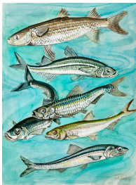
CHARLES YVER Petit Atlas des Poissons, Volume I, Plate IV: PERCÉSOCES et ISOSPONDYLES, Muge, Prêtre, Hareng, Sardine, Anchois, & Eperlan , c. 1941 watercolor on paper 10 x 7 inches 17 3/4 x 14 5/8 inches framed signed lower right (CY3722)