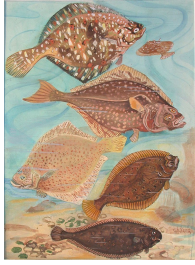
CHARLES YVER Petit Atlas des Poissons, Volume I, Plate XI: HÉTÉROSOMES, Plie, Flétan, Turbot, Limande, & Sole, c. 1941 watercolor on paper 10 x 7 inches 17 3/4 x 14 5/8 inches framed signed lower right (CY3733)