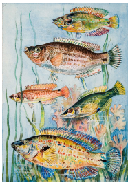
CHARLES YVER Petit Atlas des Poissons, Volume II, Plate III: LABRIFORMES, Crénilabre ocellé, Crénilabre Paon (female), Rouquié, Sublet, & Crénilabre Paon (male) , c. 1941 watercolor on paper 10 x 7 inches 17 3/4 x 14 5/8 inches framed signed lower right (CY3734)