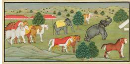
RAJA RAM SHARMA Held Back , 2014 hand ground mineral pigments with gum arabic on paper 7 x 12 3/8 inches paper signed lower right (RR7319)