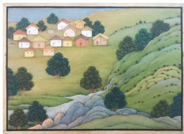
RAJA RAM SHARMA Urbanization V , 2015 hand ground mineral pigments with gum arabic on paper 6 1/4 x 8 1/4 inches 13 1/2 x 14 7/8 inches framed signed lower right (RR7336)