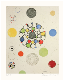
DAN RIZZIE Nizamuddin , 2015 lithograph, relief, collage, chine collé 38 x 30 inches 41 x 32 3/8 inches framed Ed. 29/30 numbered lower left; signed, dated lower right (DR7555.29)