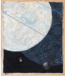
BRYAN HUNT Deep Field with Quarry , 2015 oil, acrylic, charcoal, photograph on canvas 34 3/8 x 28 3/4 inches signed and dated lower right (BH7557)