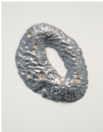
BRYAN HUNT Oceanus , 2013 cast Aqua-Resin, metallic paint 16 1/2 x 12 1/4 x 2 inches unique signed verso (BH7583)