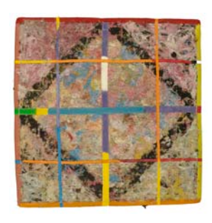
Semi-Perfect, 1979-83 acrylic, thread and fabric on canvas 20 x 20 inches signed, titled and dated verso