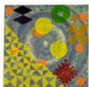
Spear , 1974 serigraph, relief and embossing on double couched Upper U.S. Paper Mill handmade paper with unmacerated cotton threads. The die-cut center extracted from Alan Shields' Shield 8 1/2 x 8 1/2 inches edition of 48