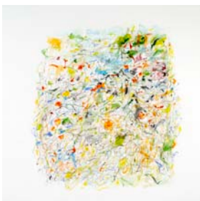
ROBERT HARMS Some Orange, 2008 oil and pencil on canvas 48 x 48 inches