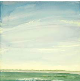
JANE WILSON Clear and Cool , 2006 watercolor on paper 8 x 8 inches 15 5/8 x 15 3/8 inches framed