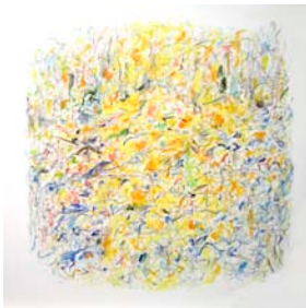
ROBERT HARMS Untitled, 2008 oil on canvas 48 x 48 inches