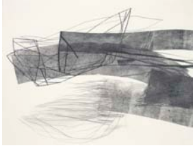
CHRISTINE HIEBERT Untitled (rd.09.1) , 2009 water-based etching ink, charcoal on paper 18 x 23 1/2 inches