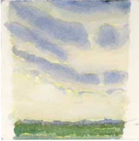
JANE WILSON Afternoon Clearing , 2008 watercolor on paper 8 x 8 inches 15 5/8 x 15 3/8 inches framed