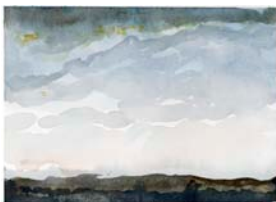
JANE WILSON The First Day of All , 2008 watercolor on paper 7 x 10 inches 14 7/8 x 17 5/8 inches framed