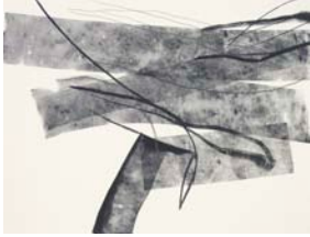
CHRISTINE HIEBERT Untitled (rd.09.2) , 2009 water-based etching ink, charcoal on paper 18 x 23 1/2 inches