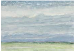
JANE WILSON Peeking Sun , 2006 watercolor on paper 5 x 7 inches 12 5/8 x 14 1/2 inches framed