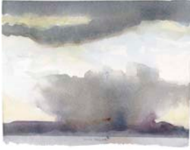
JANE WILSON Hurricane Rising , 2008 watercolor on paper 7 x 8 3/4 inches 14 7/8 x 17 5/8 inches framed