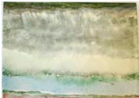
JANE WILSON Traveling Rain , 2008 watercolor on paper 5 x 7 inches 12 5/8 x 14 1/2 inches framed