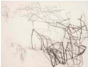
CHRISTINE HIEBERT Untitled (sc.08.27) , 2008 charcoal on paper 18 x 23 1/2 inches 21 1/8 x 26 5/8 inches framed