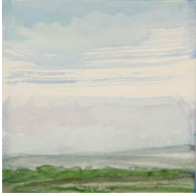
JANE WILSON Distant Summer , 2006 watercolor on paper 8 x 8 inches 15 5/8 x 15 3/8 inches framed