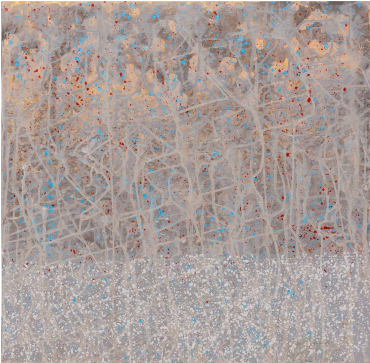
Autumn Grigio , 2023, acrylic on canvas, 24 x 24 inches