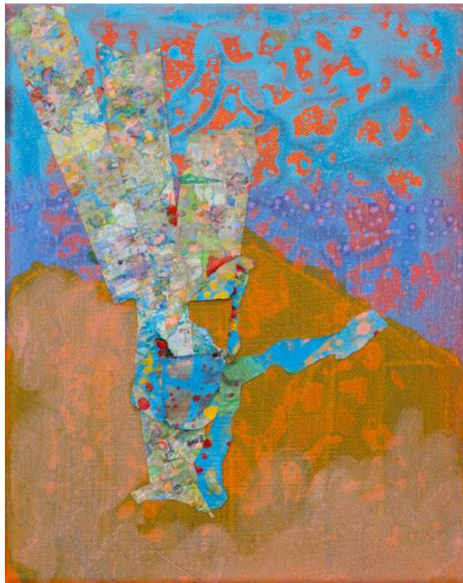
Nascent , 2023, acrylic on canvas with collage elements, 10 x 8 inches