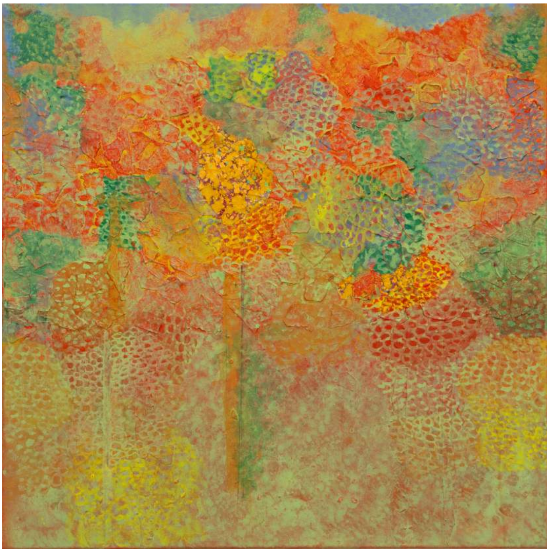
By the Golden Sand , 2023, acrylic on canvas, 24 x 24 inches