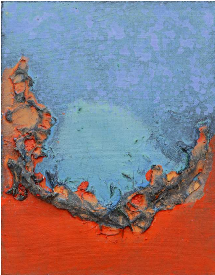
Painting with a Necklace , 2023, acrylic on canvas with collage elements, 14 x 11 inches