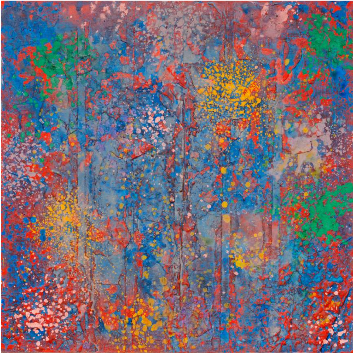
Before Dark , 2020, acrylic on canvas with collage elements, 24 x 24 inches