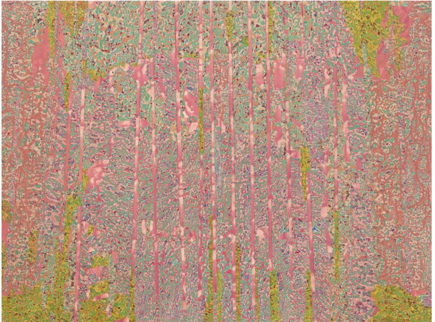
Raffa, 2009, acrylic on canvas over wood panel, 36 x 48 inches