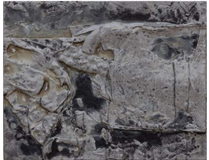
Light at the End , 2023, acrylic on canvas with collage elements, 10 x 8 inches