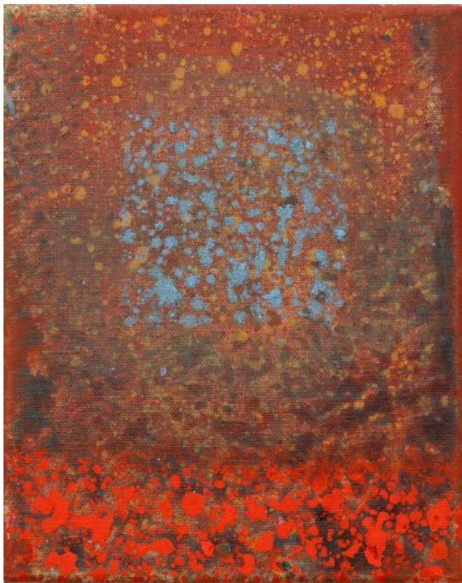
Blue Light , 2023, acrylic on canvas, 10 x 8 inches