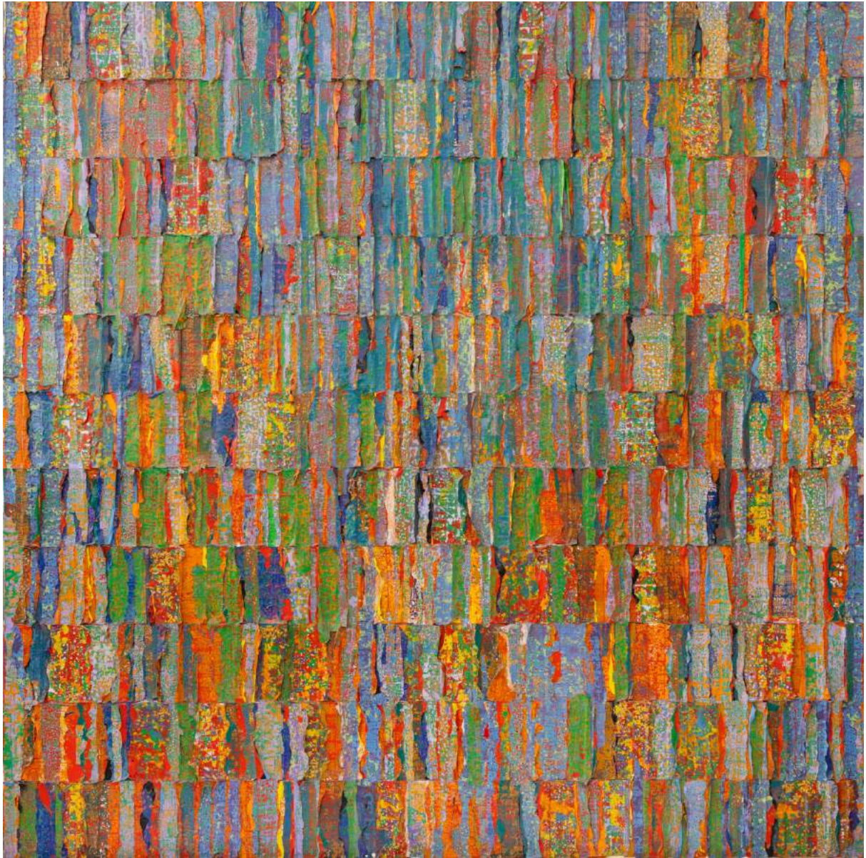
Color in Three Dimensions , 2023, acrylic on canvas, 66 1/4 x 66 1/4 inches