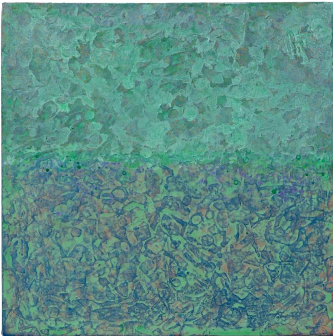
d'Inverno , 2020, acrylic on canvas, 24 x 24 inches