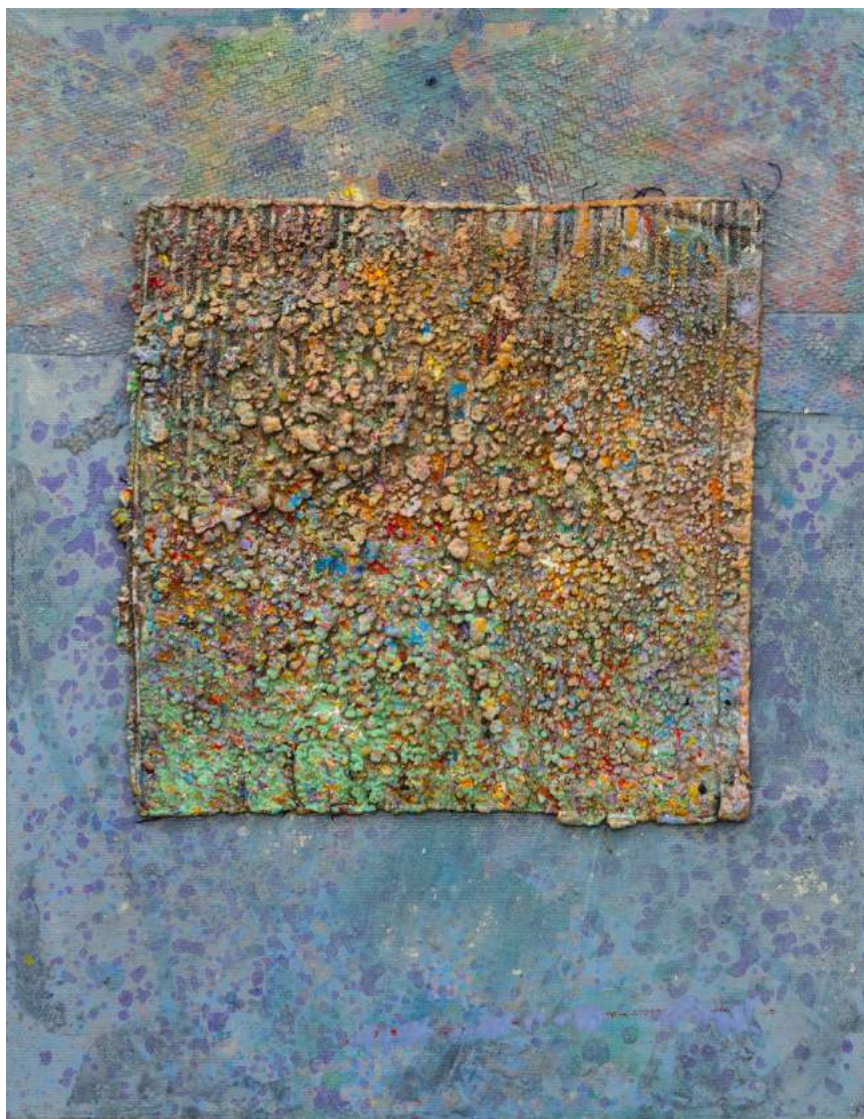
Relic , 2023, acrylic on canvas with assemblage (fabric), 14 x 11 inches