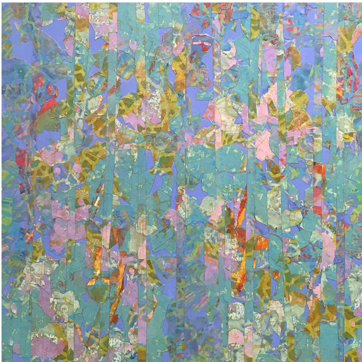
Azzurro , 2018, acrylic on canvas over wood panel, 24 x 24 inches